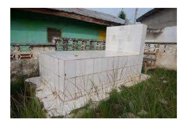
Tomb of Madam Suakoko in Suakokota, Bong County

In 1964 indigenous Liberians living in the hinterland from Bong, Grand Gedeh, Nimba and Lofa were given county status with full representation in the National Legislature of Liberia through President William V.S. Tubman's National Integration and Unification Policy. Before then, the government of Liberia exercised an indirect rule system whereby Liberian citizens mainly from other coastal counties like Maryland, Sinoe, Grand Bassa, Montserrado, and Grand Cape Mount ruled and represented the people in the hinterland without the citizens' input.