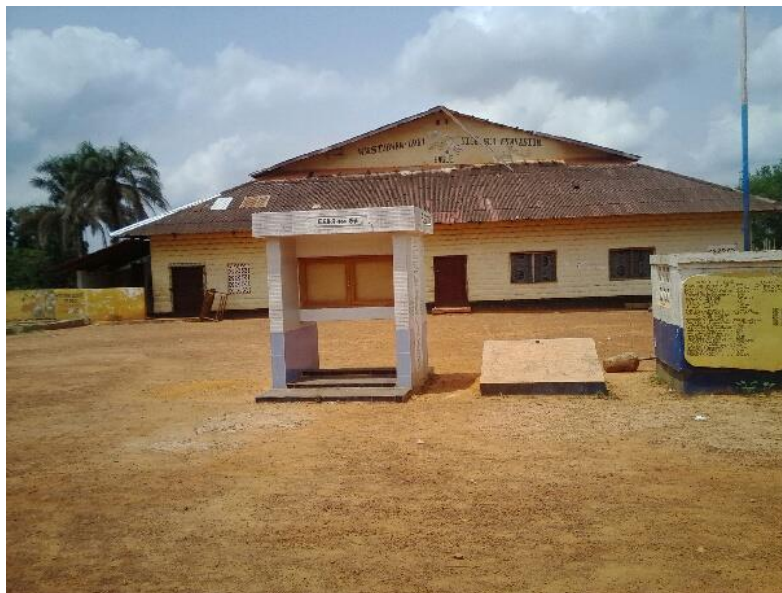
Tubman-Gray High School Eagles Gymnasium, venue of the Upcountry Basketball Tournament