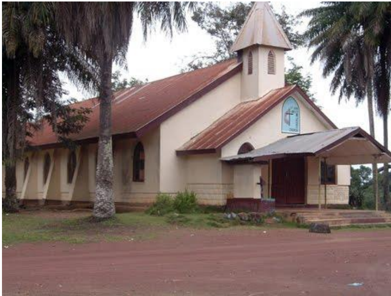
St. John's United Methodist Church, Gbarnga, Bong County, Liberia

The Gbarnga Methodist Mission School was founded in 1949 in the City of Gbarnga, Bong County, in Central Liberia, by the Methodist Church of Liberia (now known as United Methodist). The goals and objectives of the Methodist Mission was to provide the best learning environment possible for students attending Tubman-Gray Junior and Senior High School and later the Gbarnga School of Theology that was augmented to the Mission to carry out and enhance the Christian ministries of the United Methodist Church in Central and Northern Liberia.