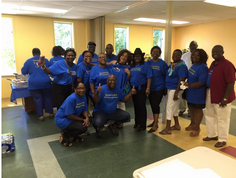
Some Alumni from the 2015 reunion in Maryland, U.S.A.